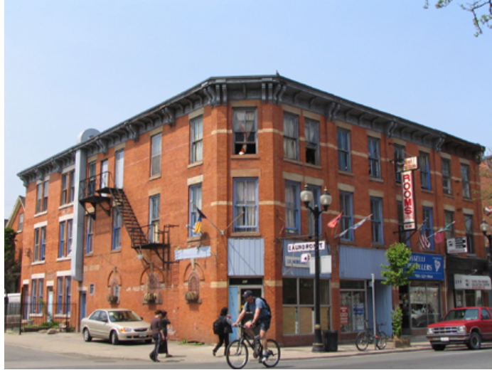
193-197 James Street North Pre-redevelopment