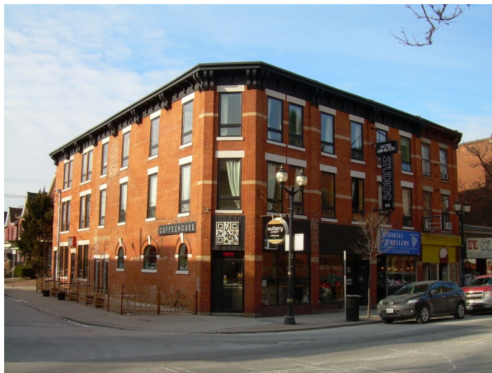
193-197 James Street North – Post Redevelopment

Appendix “B” to Report PED13190 identifies the location of the property.