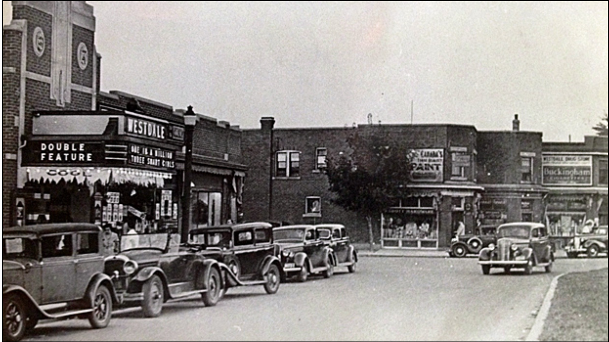
Westdale Theatre circa 1935.