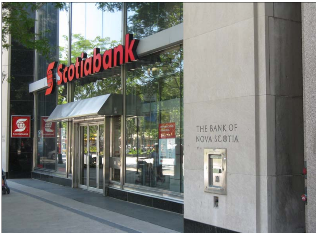
12-14 King Street East (2012)