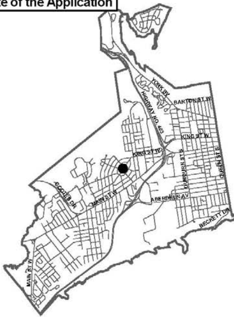
Ward 1 Key Map