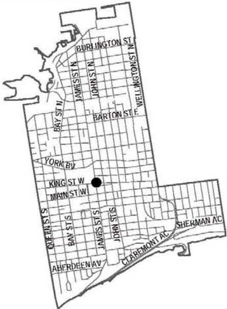
Ward 2 Key Map