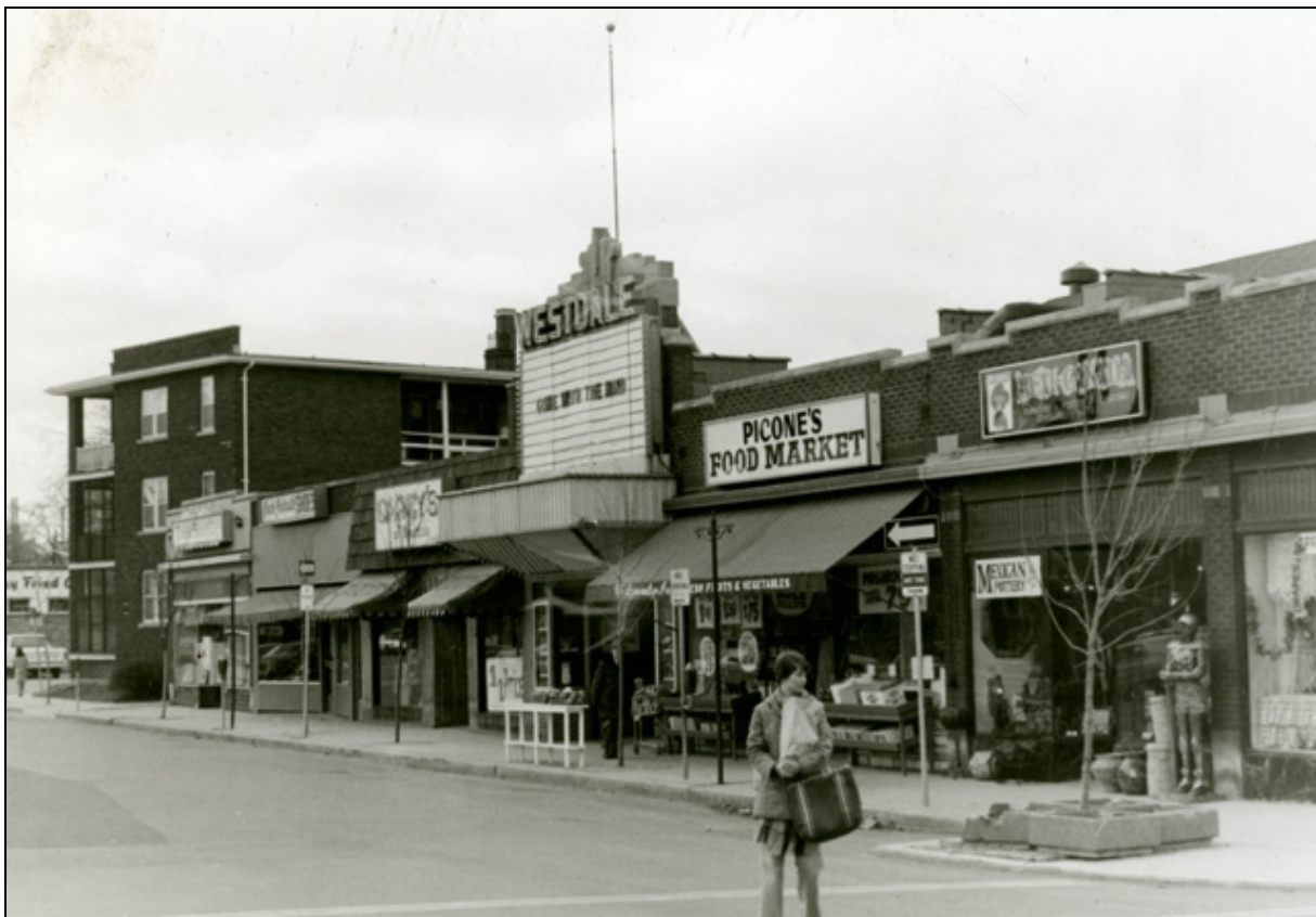
Westdale Theatre circa 1970s