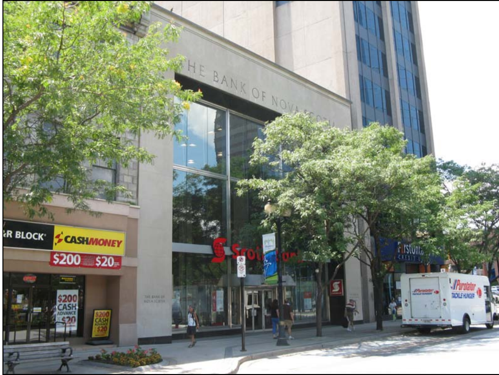
12-14 King Street East (2012)