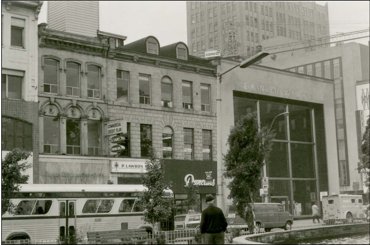
12-14 King Street East, circa 1970s.