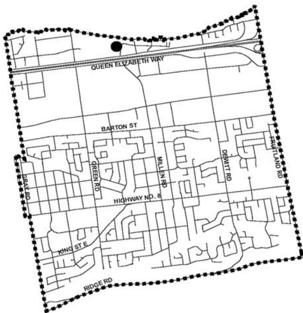
Ward 10 Key Map