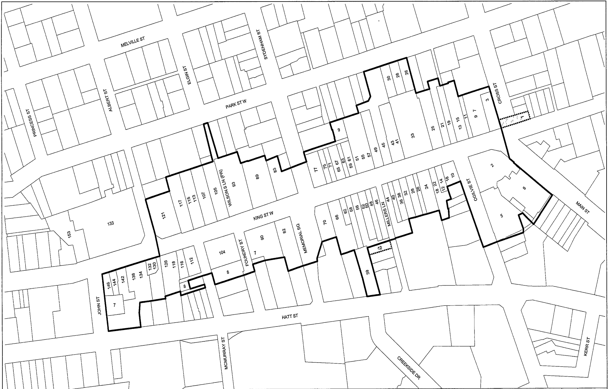
Proposed Expansion Dundas BIA Boundary