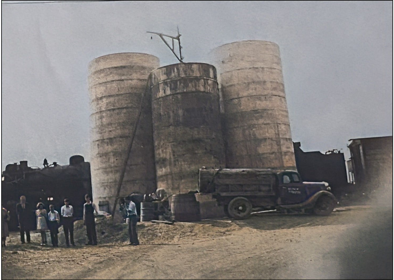
Figure 11: Harris Grain Elevation under construction, 1943