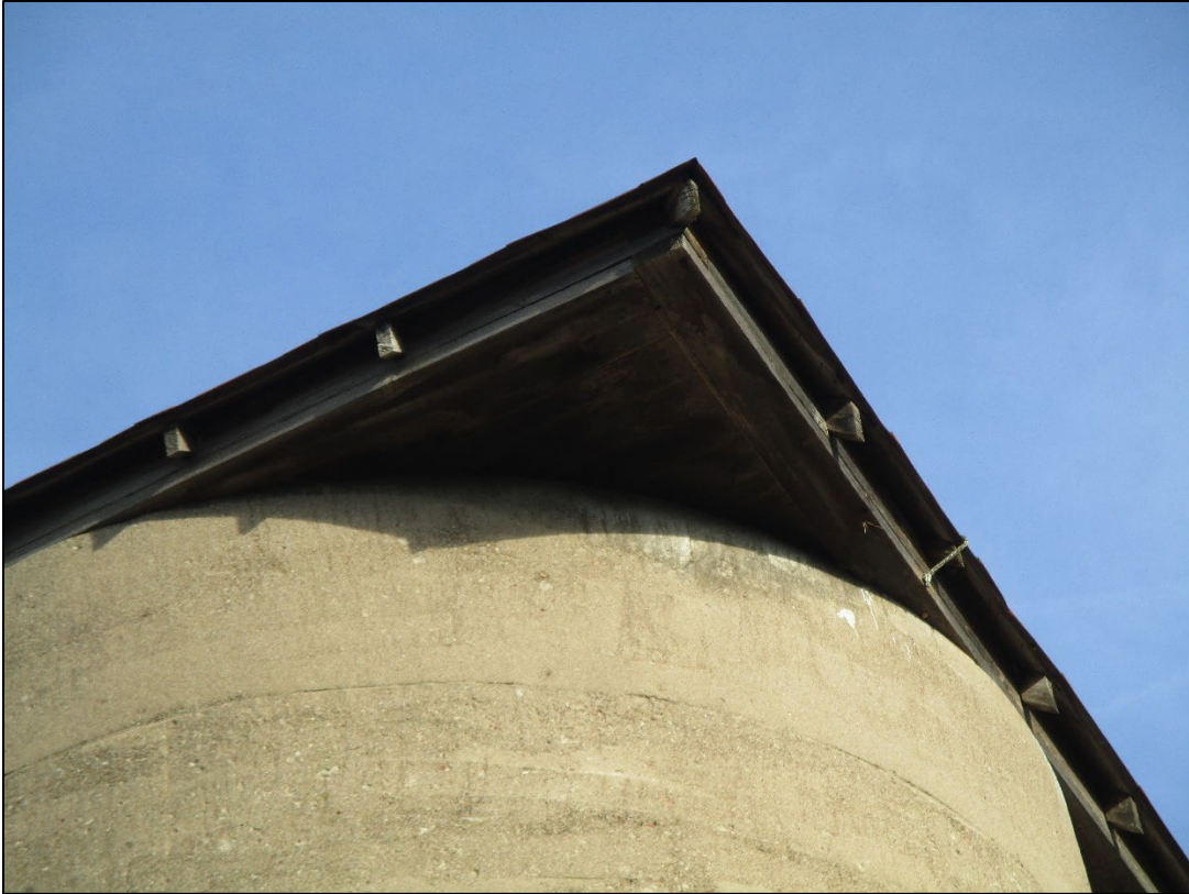
Figure 9: Detail View showing roof construction