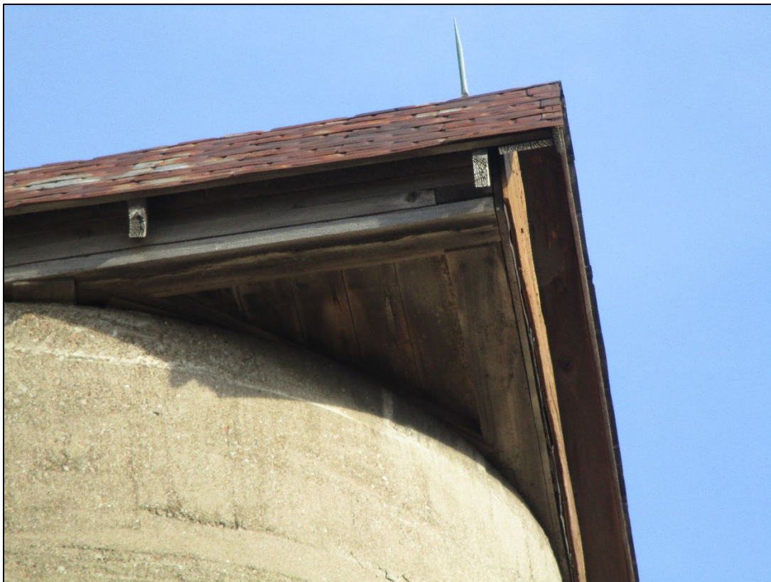
Figure 10: Detail View showing roof construction