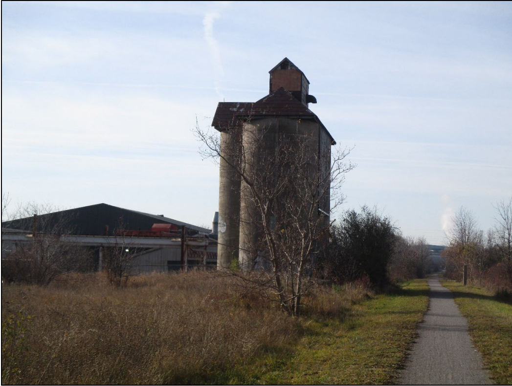
Figure 3: Side Elevation (North) looking along the Chippewa Trail