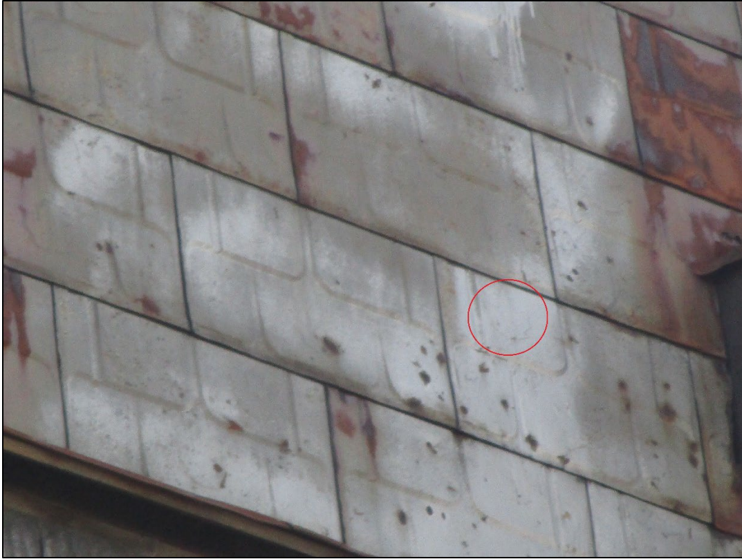
Figure 7: Detail View of Maple Leaf Motif stamped on sheeting