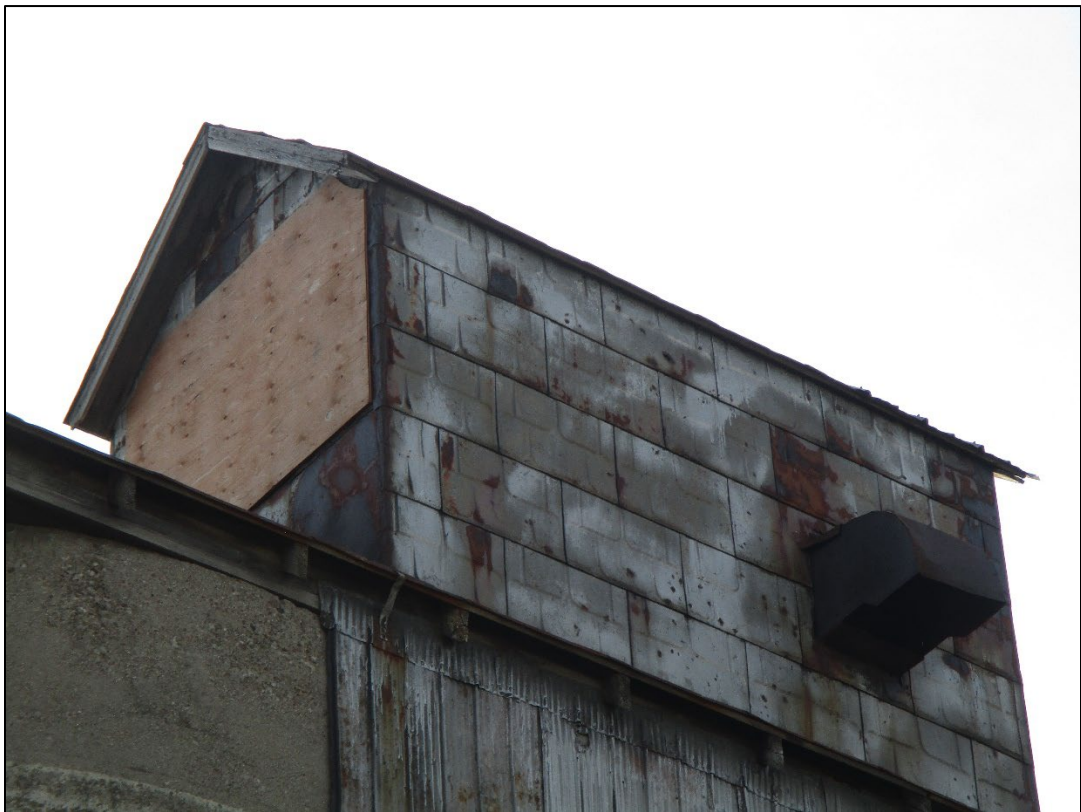
Figure 6: Detail View of Headhouse