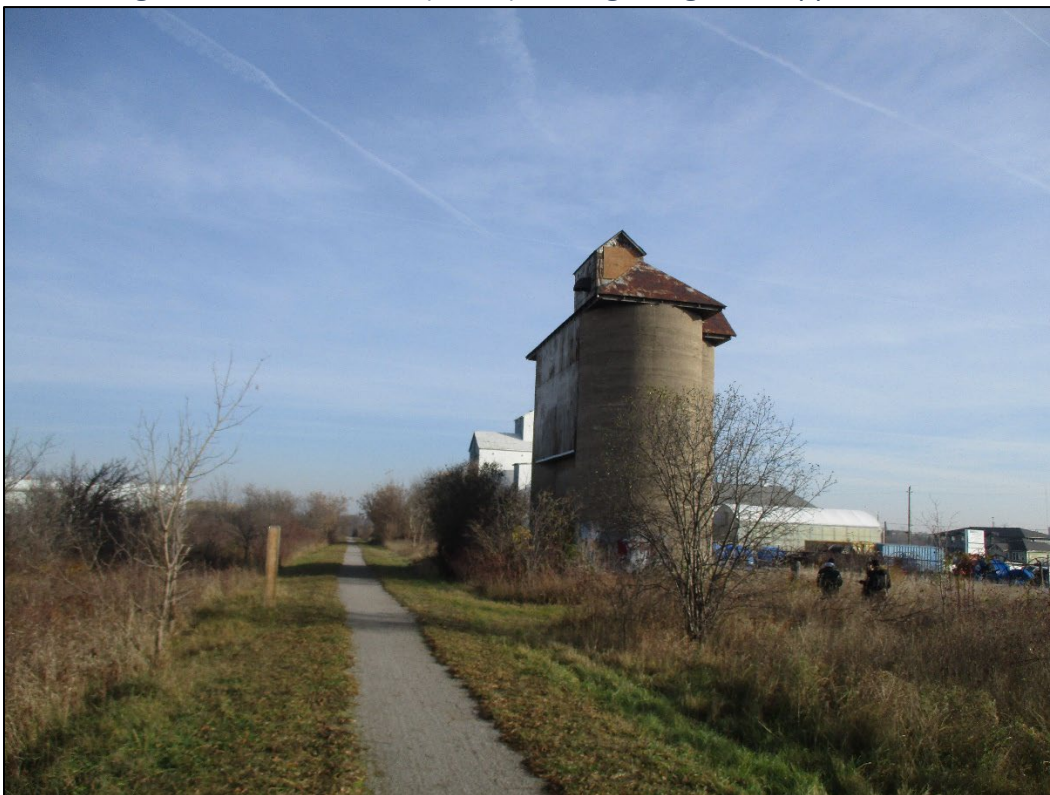
Figure 4: Side Elevation (South) looking along the Chippewa Trail