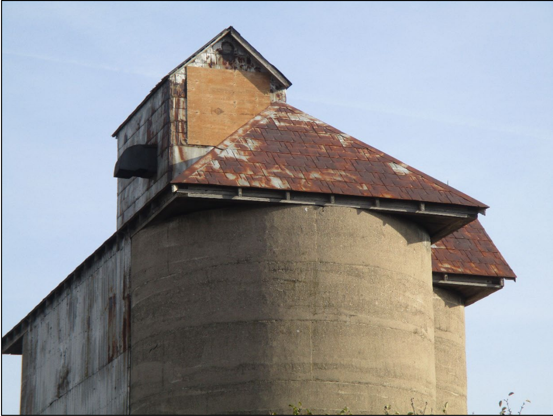
Figure 5: Detail View of Roofline and Headhouse