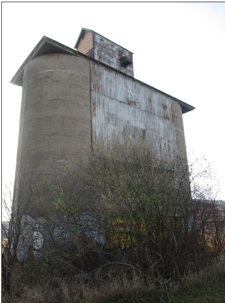
Figure 2: View of Subject Property from West