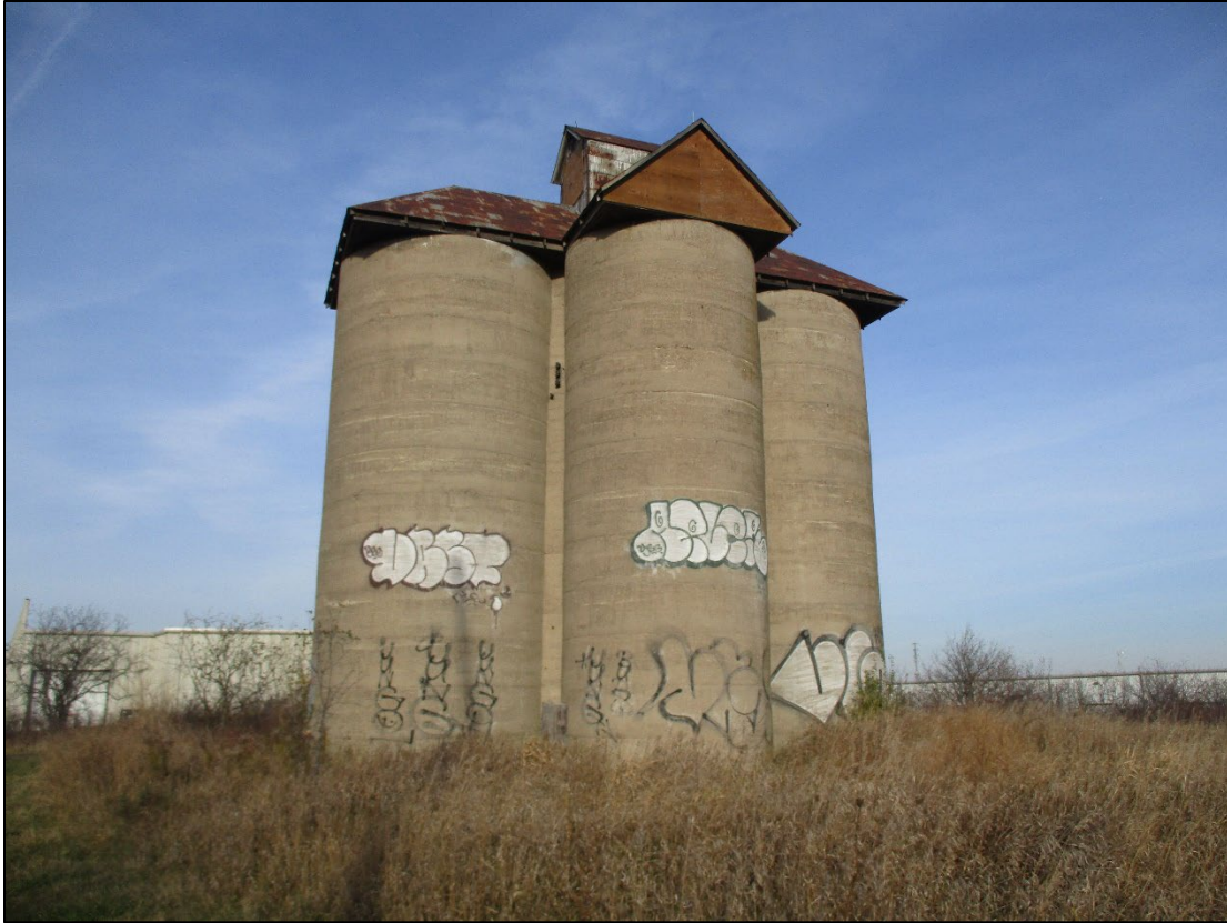
Figure 1: Front Elevation (east) facing Dartnall Road

All images taken by City of Hamilton Staff on November 16, 2023 unless otherwise noted.