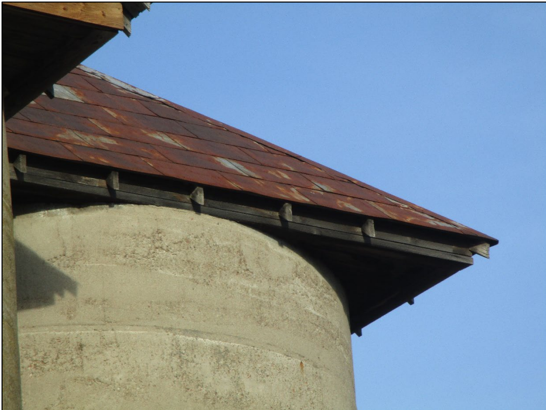
Figure 8: Detail View showing roof construction